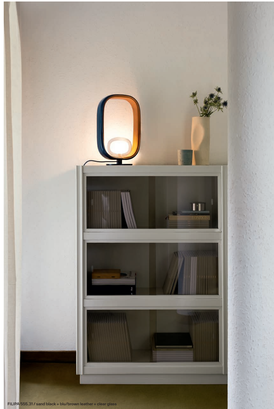
FILIPA 555.31 / sand black + blu/brown leather + clear glass