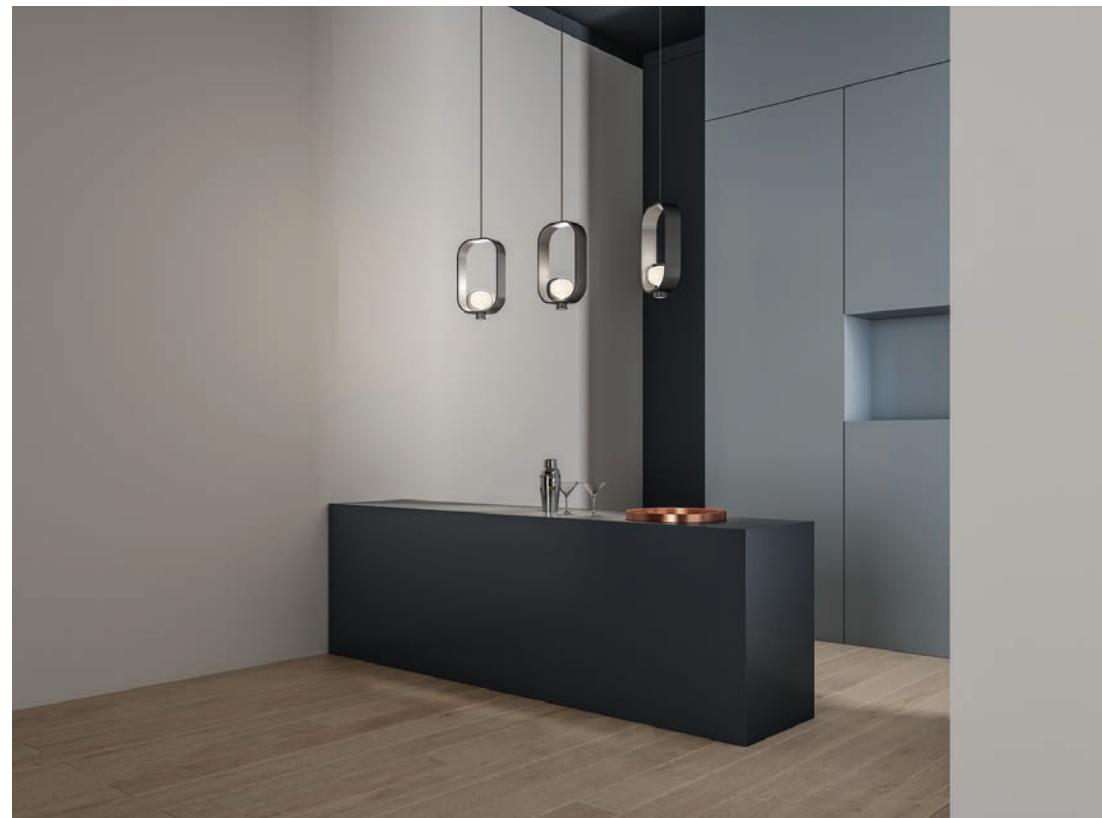
FILIPA 555.22 / sand black + sand grey + clear glass