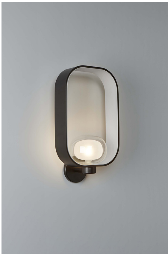
FILIPA 555.41 / sand black + sand grey + clear glass