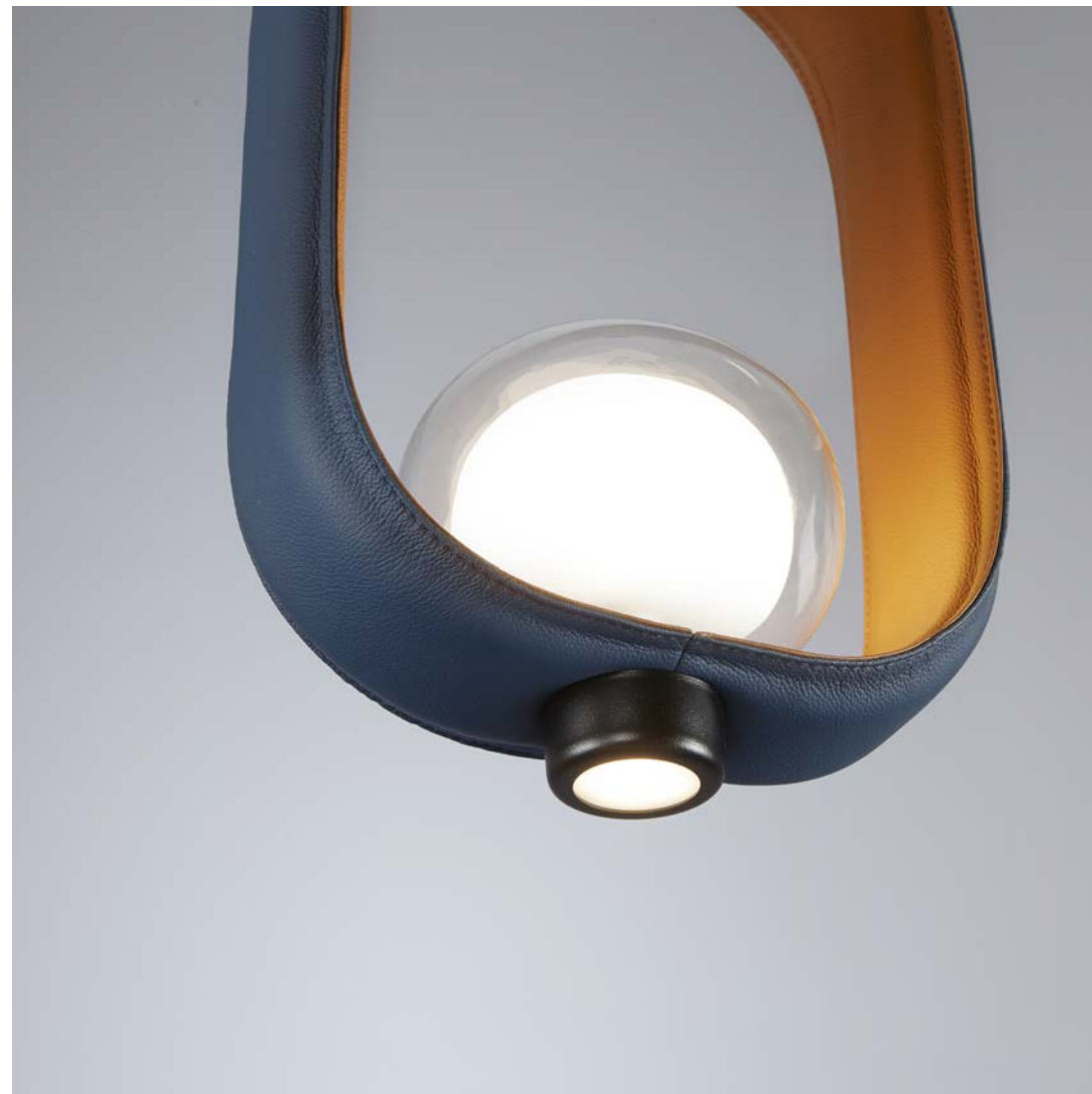
FILIPA 555.22 / sand black + blu/brown leather + clear glass