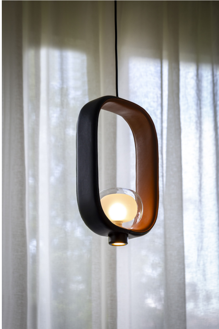
FILIPA 555.22 / sand black + blu/brown leather + clear glass